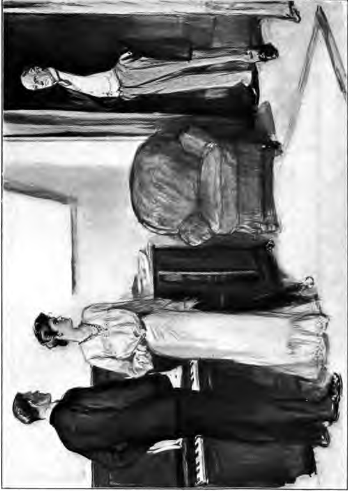
The cold Magnate of the West End stood between the folding-doors.